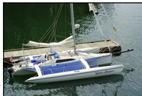
Waterskipper in Mustgrave Landing, BC

Waterskipper is still up on Hanks web site, if you want to have a look: http://home.bendcable.com/brooksfamily . There are also some cute grandchildren and a nice garden there too.