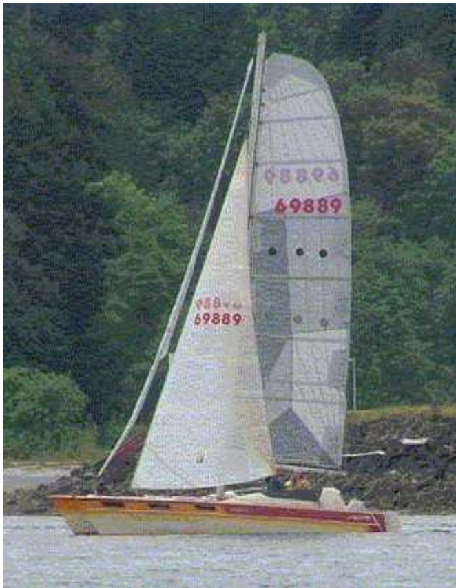
For Sale - Stiletto 27 SE Catamaran w/dual centerboards (1982)