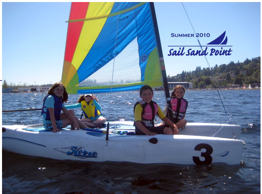
Children sailing Hobie Wave at Sail Sand Point

Every year sailors from around the Northwest come to Sail Sand Point in Seattle's Magnuson Park on Lake Washington to end the summer with the "Octoberfest Regatta." Last year 180 young