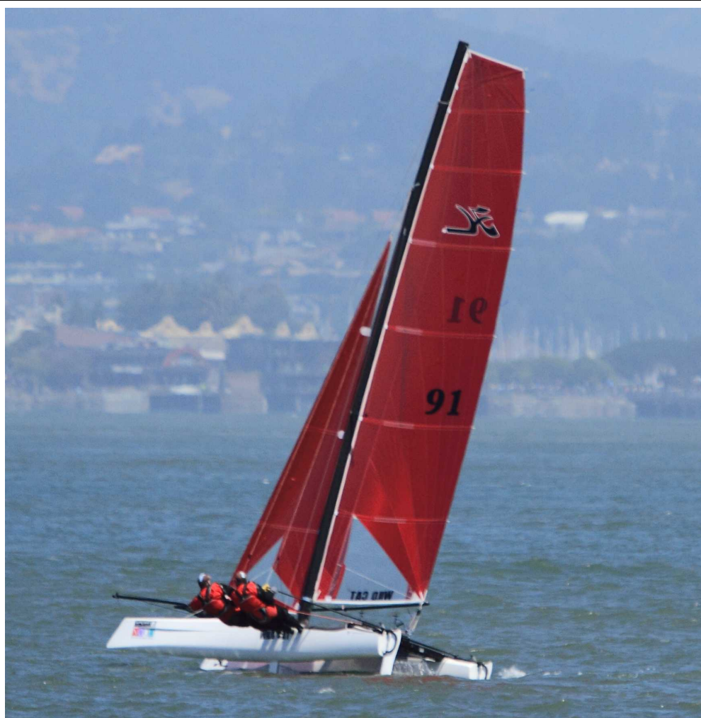
Flying a hull and trapping out! Hobie at NOOD race.