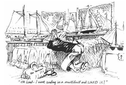
Illustration 1: From Bay Area Multihull Association newsletter The text at the bottom reads, "Oh Lord-I went sailing in a multihull and LIKED it!"