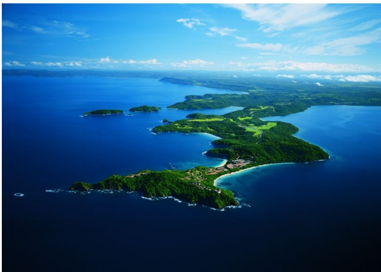
Another nice destination. The Pacific coast of Costa Rica, near Nicaragua.