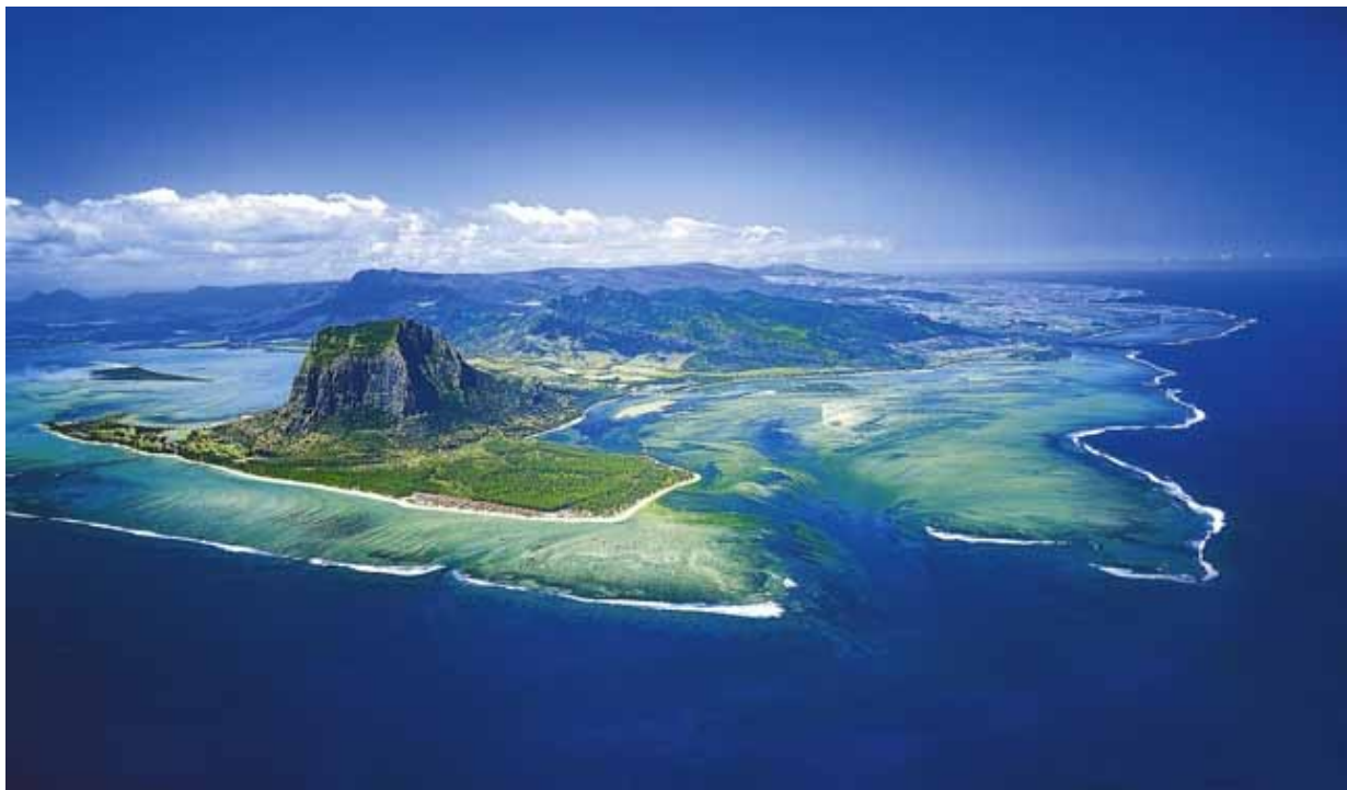
Joyon's destination, the Island of Mauritius.