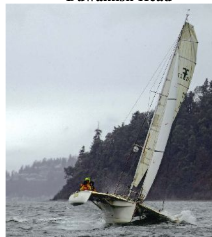
Danger Zone-2005 Duwamish Head

This year the wind was strong enough than an aeolian harp could complete with a rock concert.