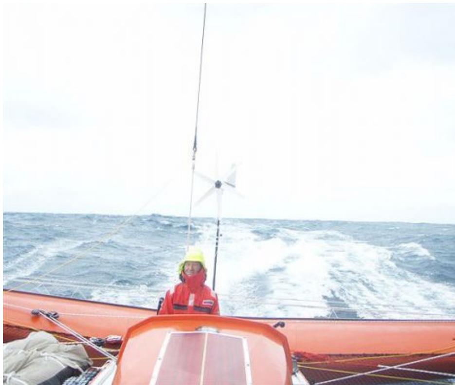
Right now Francis Joyon is on the way home with a little over 2000 miles to go. The bolt in the top starboard cap shroud has come loose so a new record is not in the bag yet.

dropped the chute in the water so it would go behind the boat and Jim and I muscled the sail back on the boat against the pressure of the water. Well, Pax was well gone by that time and we reset the chute and were on our way.